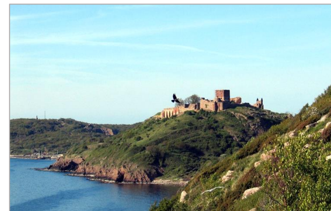
Hammershus - one of Northern Europe's best-preserved castle ruins.

Vang is one of Bornholm's treasures, originally a fishing village, later also a shipping port for granite, which until the late 1900s was broken in the "Ringebakker" south of the village. The low-rise buildings, which are spread beautifully up the steep slope, in many people's minds have a southern feel. The building in the midst of the green nature, breathes peace and idyll. There are excellent restaurants in the city, and the surrounding area offers countless experiences. Hikes to the protected nature areas "Slotslyngen" and "Ringebakker" with the many abandoned quarries, just to name a few. Other sights in the area include the island's only preserved watermill with overshot wheel and artist Peter Bonnén's modern bridge across the gorge at the quarry south of the harbor. The ruins of "Hammershus" 3 km north of Vang can be reached on foot in less than an hour. There is a gallery and sculpture park, a pentaquin court as well as a playground for smaller children in the port's domains.